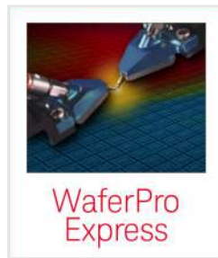
Keysight WaferPro Express On-wafer Measurement Program www.keysight.com/find/eesof-waferpro-express

For more information on Keysight Technologies' products, applications or services, please contact your local Keysight office. The complete list is available at: www.keysight.com/find/contactus