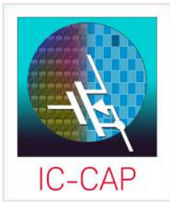
Keysight IC-CAP Device Modeling Software www.keysight.com/find/eesof-iccap