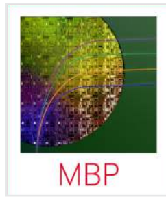
Keysight MBP Turn-key Device Model Extraction Solutions www.keysight.com/find/eesof-mbp