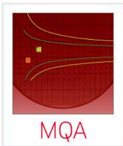
Keysight MQA Device Model Validation Software www.keysight.com/find/eesof-mqa